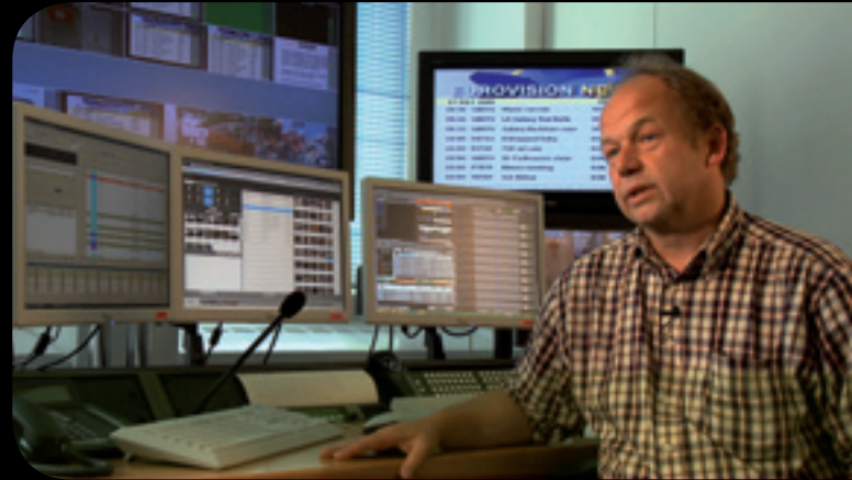
The "Intranet de Production" integration framework enables Dalet users and Avid editors to work collaboratively. Exchange of media and metadata between EVS, Dalet, and Avid are fully transparent.

Dalet and EVS are connected to the Front Porch Divarchive HSM to move material from the high resolution material on the EVS storage to the Storagetek tape library. Media transfers remain fully transparent for the users; the proxy resolution remains online for search and browsing. Dalet manages rule-based purges of the high resolution and proxy resolution content. The Dalet system is also connected to "Tramontane", a homemade archiving system widely used by RTBF users by taking advantage of the Dalet Web Services API.